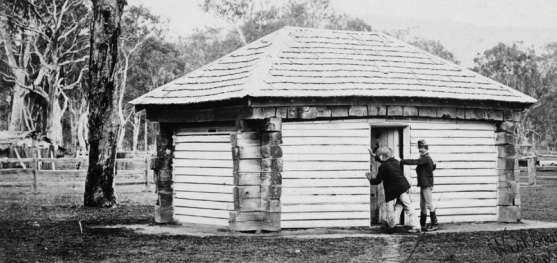
The Avenel bush lock-up where Red Kelly was incarcerated, serving 4 months of a 6 month sentence.