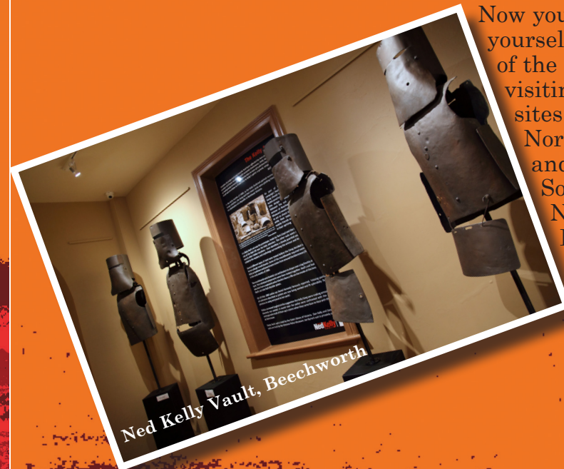
Ned Kelly Vault, Beechworth

Now you can explore for yourself the many pieces of the Kelly puzzle by visiting the various Kelly sites in Melbourne, North East Victoria and Southern New South Wales on the Ned Kelly Touring Route.