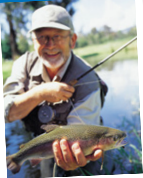
Trout, perch, redfin and murray cod all call our cool waters home.